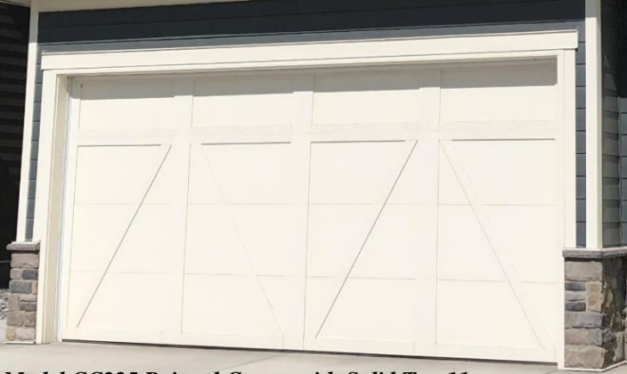
Model CC225 Painted Cream with Solid Top 11